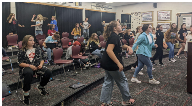
7th/8th Grade Choir Dancing/Singing

The students sing karaoke on some Fridays if they had a good week, so above is a picture during that time!